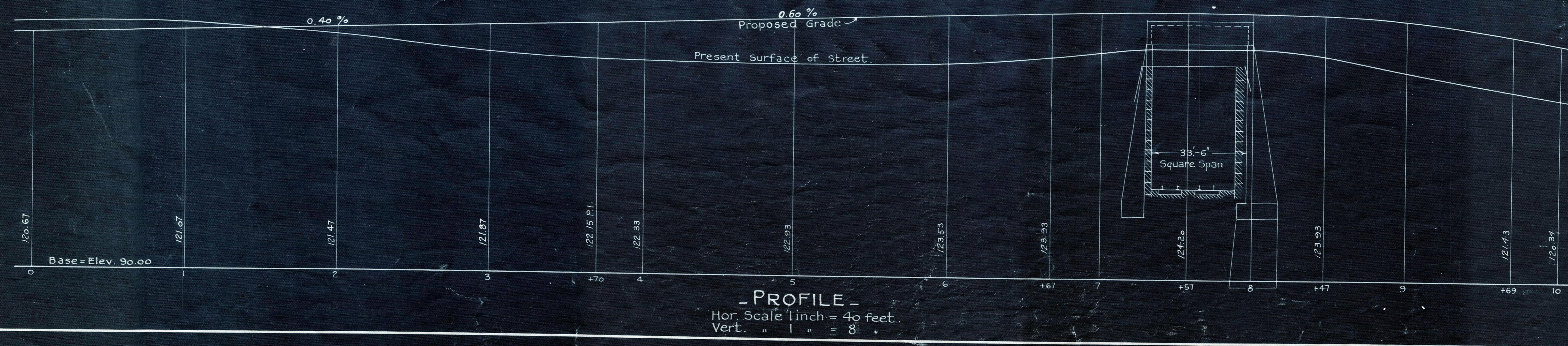
- PROFILE - Hor. Scale 1 inch = 40 feet. Vert. " 1 " = 8 "